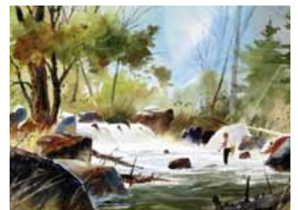
Between the Rocks , watercolor ©2016 Tony Couch