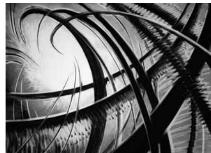
Target , charcoal ©2017 Gary Chapman