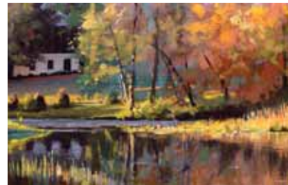
Kaleidoscope (detail), pastel ©2016 Liz Haywood-Sullivan

Visit hsvmuseum.org/museumacademy/master-artist-workshops-2/ for details or to register.