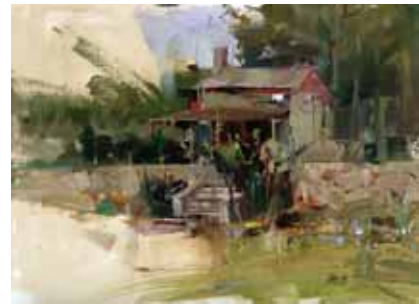
Dies Ranch 2 , oil on canvas ©2019 Qiang Huang

Visit hsvmuseum.org for details or to register. Check back soon for additional 2020 workshops like the one below!