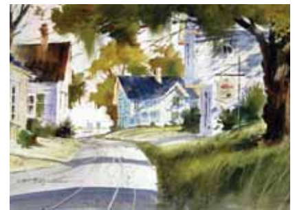
Cathy's Place (detail) , watercolor ©2016 Tony Couch