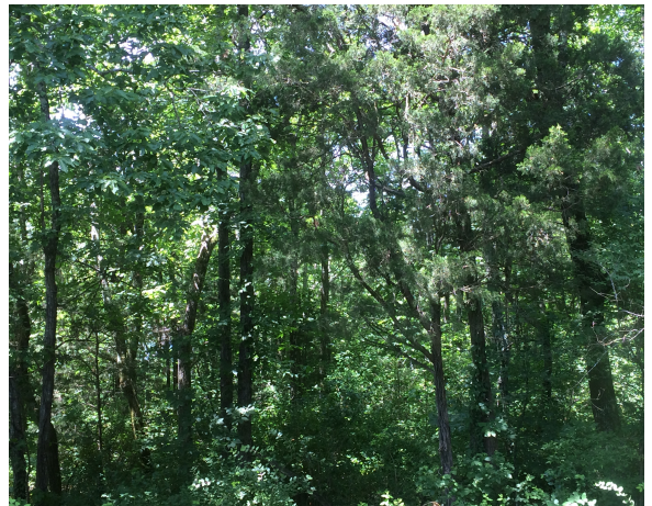
Spring Sunny Day!