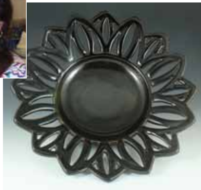
Black, Low, Large Bowl , ceramic ©2018 Lynnette Hesser