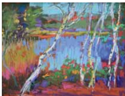
Birches and Wetlands, pastel