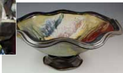
Large Thrown Rim Bowl with Thrown Wavy Foot , ceramic ©2018 Steve Loucks