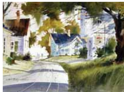
Cathy's Place (detail) , watercolor ©2016 Tony Couch