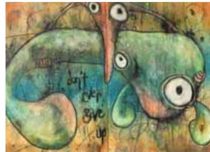
Don't Give Up, Forgiveness Journal , paint and ink on newsprint ©2018 Leslie Wood