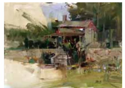
Dies Ranch 2 , oil on canvas ©2019 Qiang Huang