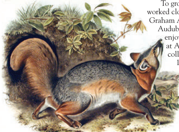
Grey Fox, 1845-48, hand colored lithograph