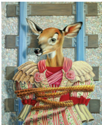
Thy Tatter’d Loving , 2012, oil on panel