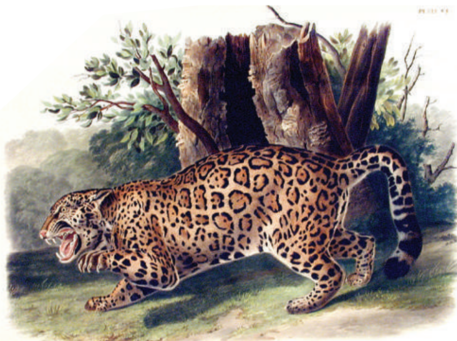
Jaguar, 1845-48, hand colored lithograph