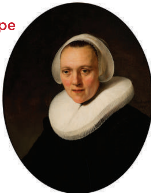
Rembrandt van Rijn (Dutch, 1606–1669), Portrait of a Forty-Year-Old Woman , possibly Marretje Cornelisdr. van Grotewal, 1634, oil on panel, 27 7/16 x 22 in. Collection of the Speed Art Museum, Purchased with funds contributed by individuals, corporations and the entire community of Louisville, as well as the Commonwealth of Kentucky.

These exciting times resulted in a Golden Age of European painting. The number of artists and the number of art collectors grew exponentially during