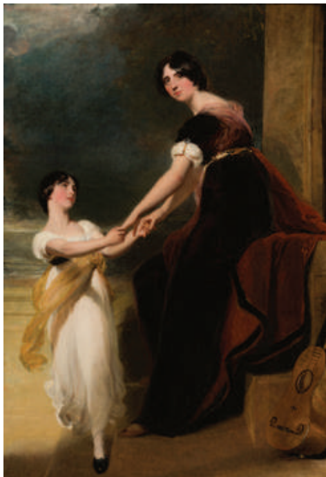
Thomas Lawrence (English, 1769–1830), Portrait of Susan, Countess of Guilford, and Her Daughter Georgiana , about 1812, oil on canvas, 82 5/8 x 58 in. Collection of the Speed Art Museum, Purchase, Museum Art Fund. 1959.2

The Speed, located in Louisville, Kentucky, is the largest art museum in Kentucky. It houses a spectacular collection of Old Master paintings, which represents the highlights and core of its permanent collection. The works have never toured as a group. Currently closed