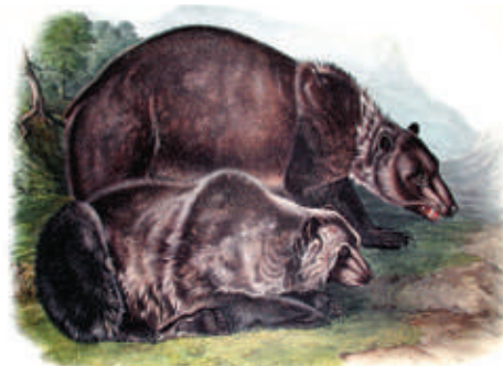
Grizzly Bear, 1845-48, hand colored lithograph