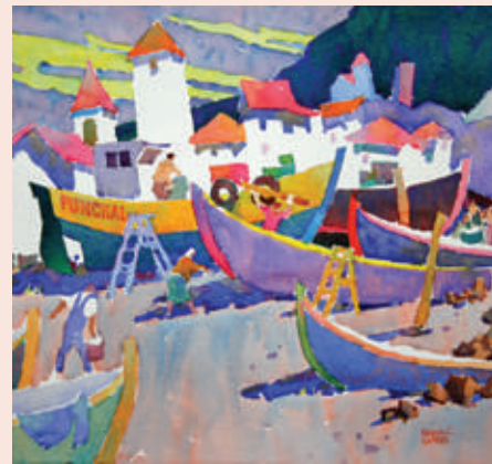
Funchal, Portugal, watercolor

Monday-Friday, April 13-17 9 a.m. to 4 p.m.