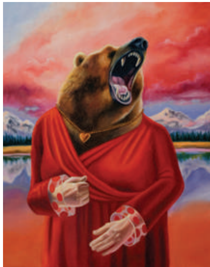
Her Tender Heir Might Bear Her Memory , 2011, oil on panel