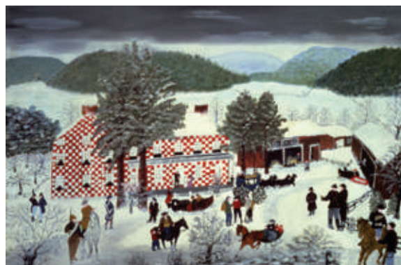
Anna Mary Robertson "Grandma" Moses (American, 1860-1961): Checkered House, 1955. Oil on pressed wood. 18 x 24 in.

To view the exhibition, non-members will be charged general admission.