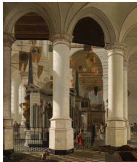
Cornelis de Man, New Church in Delft with the Tomb of William the Silent , oil on canvas, 49 x 42 1/6 in. Collection of the Speed Art Museum, Gift of the Charter Collectors 1985.8

Organized by The Speed Art Museum, Louisville, KY.