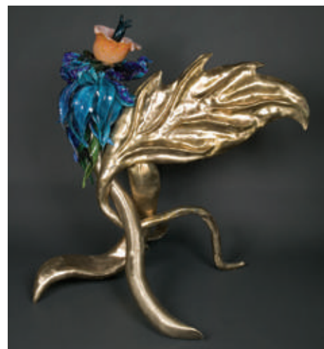
Ginny Ruffner, Sky Flower with Cumulus Leaf , 2006 stainless steel, bronze, glass

To view the exhibition, non-members will be charged general admission.