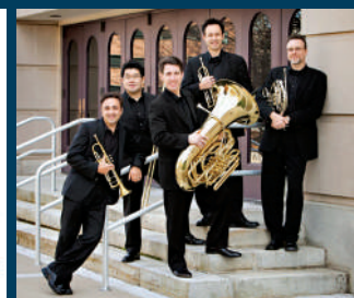
February 16, 2018 CENTER CITY BRASS QUINTET