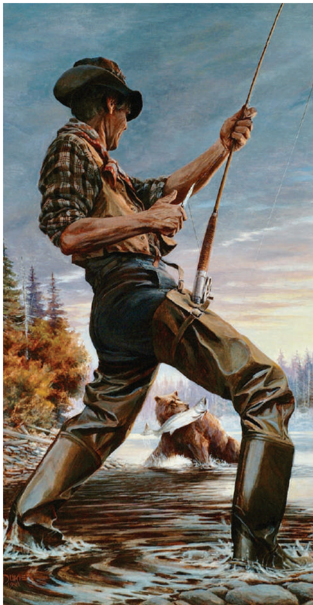
Larry Duke (Contemporary American), Two on the Line (detail), 1987, oil on canvasboard, 34 x 24.5 inches.