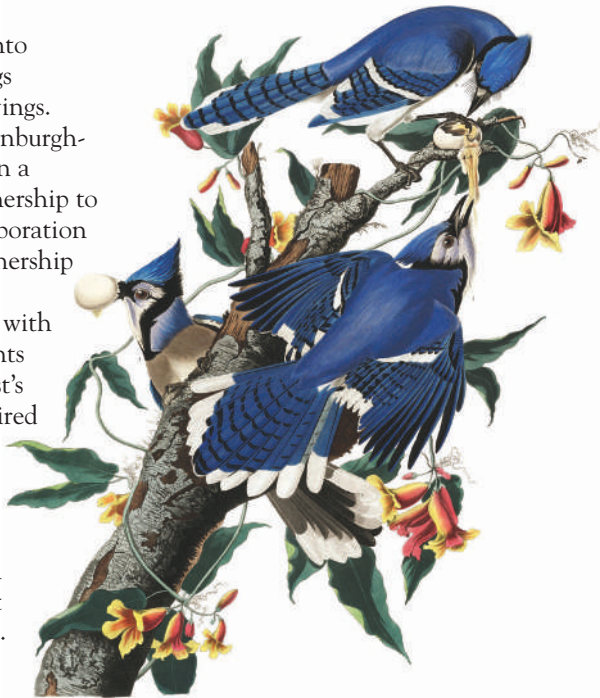
John James Audubon (1785–1851); Robert Havell (1793–1878), engraver, Blue Jay , 1830, hand-colored engraving with aquatint, From Birds of America (plate CII), 9 x 37 in. (framed).