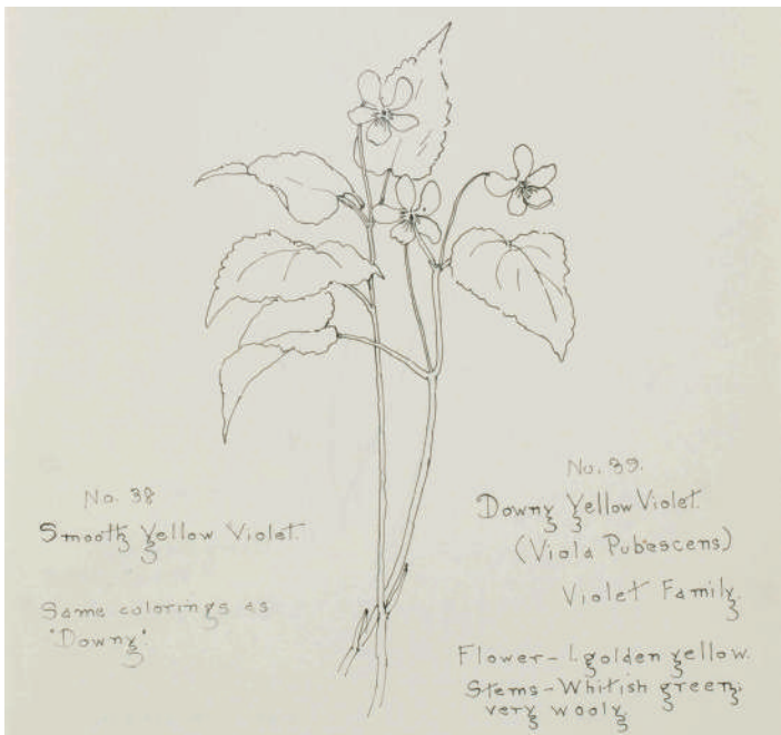
Downy Yellow Violet (Viola pubescens) , c. 1911, ink on paper, 9 x 7 inches. Charles E. Burchfield Foundation Archives. Gift of the Charles E. Burchfield Foundation, 2006.