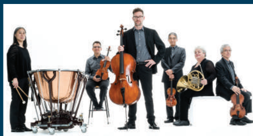
January 27, 2018 ORPHEUS CHAMBER ORCHESTRA