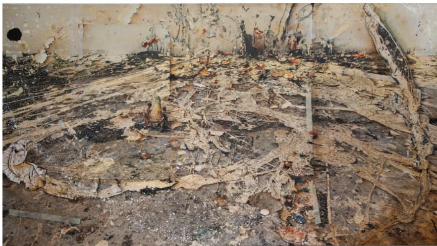
Gerry Bergstein, Carrying Babel (detail), 2016, mixed media on canvas, 34 x 66 inches.

Don’t miss the Members’ Preview Party and Awards Ceremony on Saturday, July 8, 2017 , featuring great food and drinks, live music and a meet-and-greet with some of the artists.