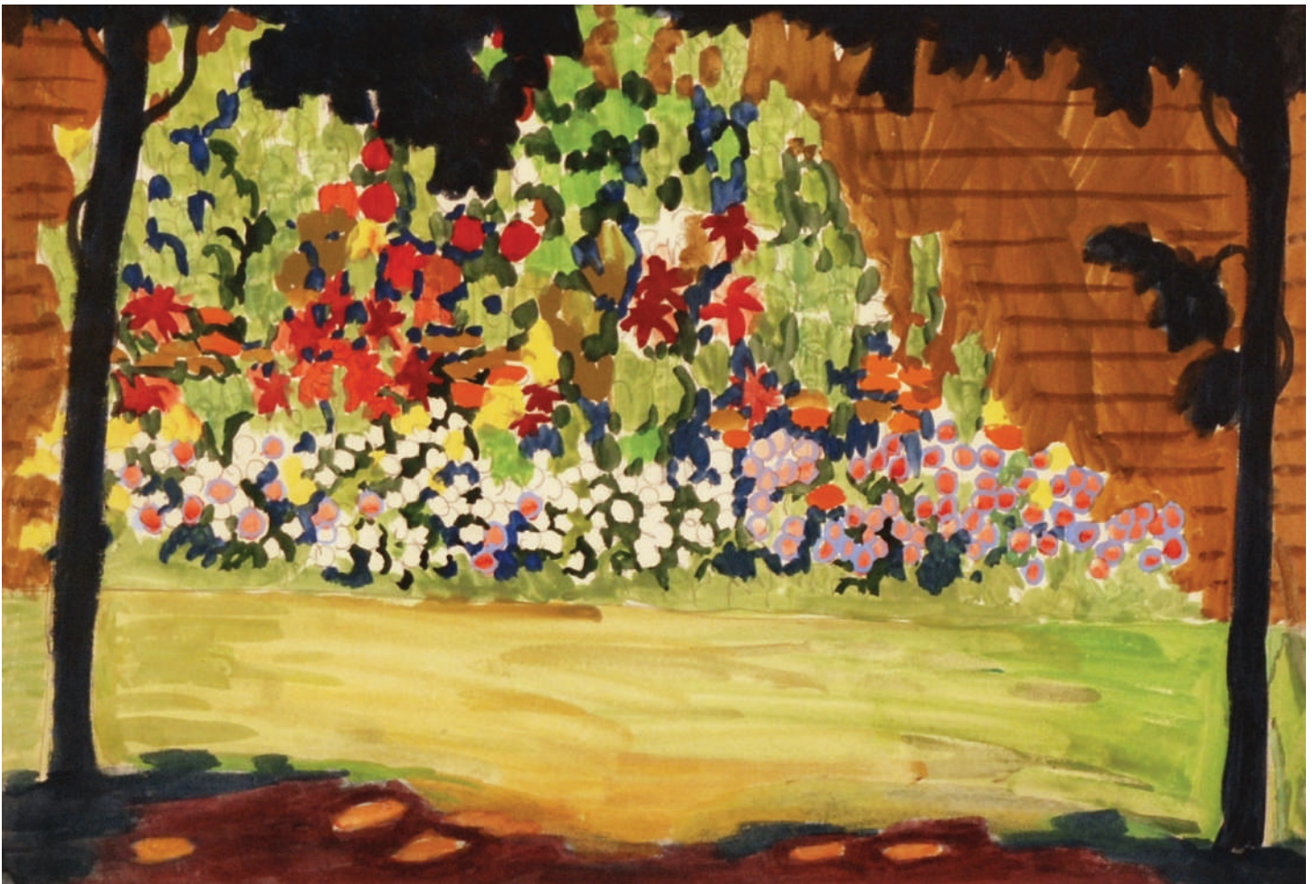
Summer Garden , 1916, watercolor on paper, 14 x 20 inches. Collection of the Burchfield Penney Art Center, Buffalo, New York.