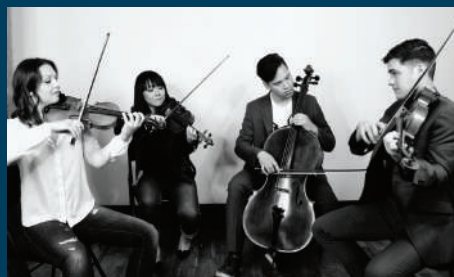
November 10, 2017 ATTACCA QUARTET