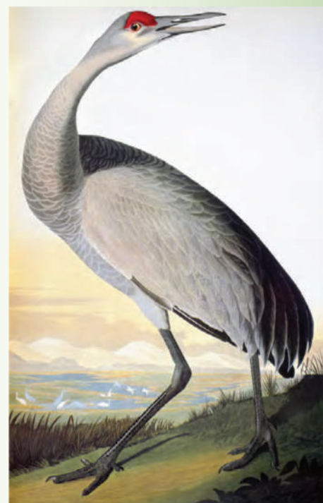
John James Audubon (1785–1851); Robert Havell (1793–1878), engraver, Hooping Crane , 1835, hand-colored engraving with aquatint, From Birds of America (plate CCLXI), 48 x 37 in. (framed).