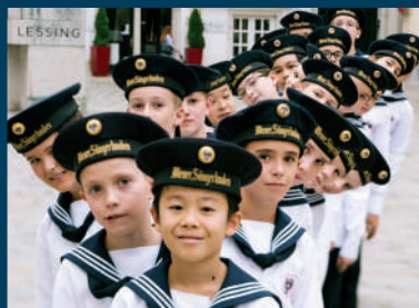
October 21, 2017 VIENNA BOYS CHOIR

The Huntsville Chamber Music Guild Celebrity Concert Series has been made possible by grants from: The Alabama State Council on the Arts, The National Endowment for the Arts, The Jane K. Lowe Charitable Foundation, Arts & Cultural Grant from Arts Huntsville funded by the City of Huntsville