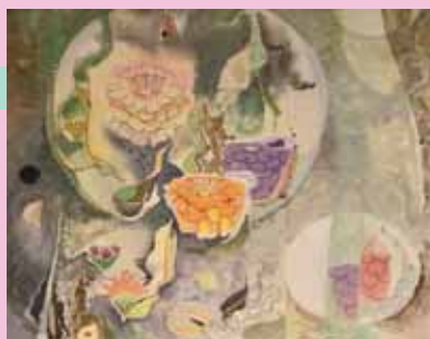
Above: Will Henry Stevens, Untitled , pastel on paper, 20 x 16 inches. Lent courtesy of Blue Spiral 1, Asheville, NC, in the Will Henry Stevens: Naturalist/Modernist exhibition. Organized by the Huntsville Museum of Art.

YAM: Exhibition for Youth Art Month March 14 – May 2, 2021