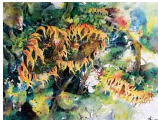
Sunflowers , watercolor ©2020 Lian Quan Zhen