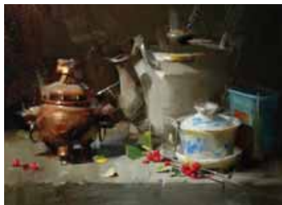
Still Life , oil on canvas ©2016 Qiang Huang