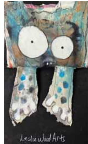
Junk Mail Journal , mixed media ©2020 Leslie Wood