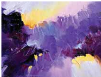
Daybreak, 2019, acrylic on canvas