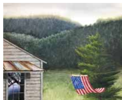
Pride , 2021, watercolor on paper ©2021 Alan Shuptrine