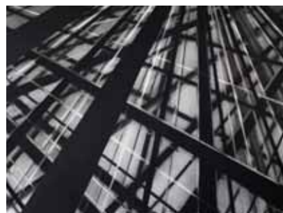
Grid , 2019, charcoal on paper ©2021 Gary Chapman