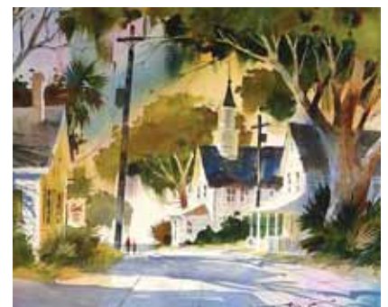
Morning Café (detail) , 2019, watercolor on paper ©2021 Tony Couch