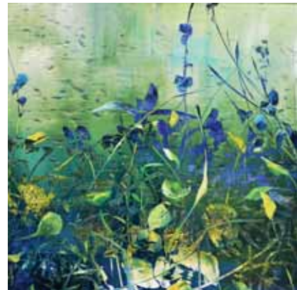
Wild Gardens, Wildflowers in Atmosphere, Riverbank , oil on dibond ©2022 David Dunlop