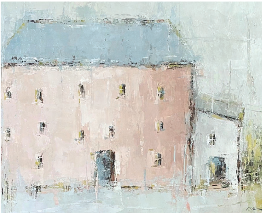
Geri Eubanks, Old French Barn . Oil on canvas, 20 x 16 in. framed