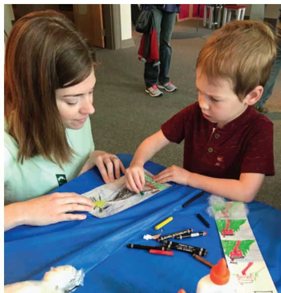
CREATE SATURDAYS PROUDLY SPONSORED BY:

Tour The Age of Armor: Treasures from the Higgins Armory Collection at the Worcester Art Museum exhibition, design shield with markers and other materials for embellishment.