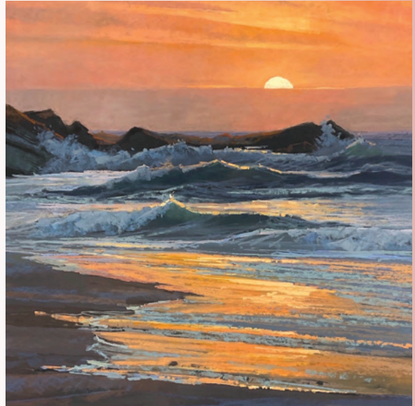
Liz Haywood-Sullivan, Sound of the Sea , pastel on paper © 2022

Wednesday-Saturday, November 1-4, 2023 9:00 a.m. - 4:00 p.m.