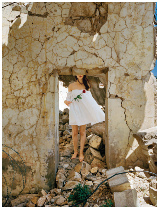
Rania Matar (Lebanese American, b. 1964), Ghinwa, Khayam Detention Center, Khayam, Lebanon , 2019. Archival pigment print, 28 3/4 x 36 in.