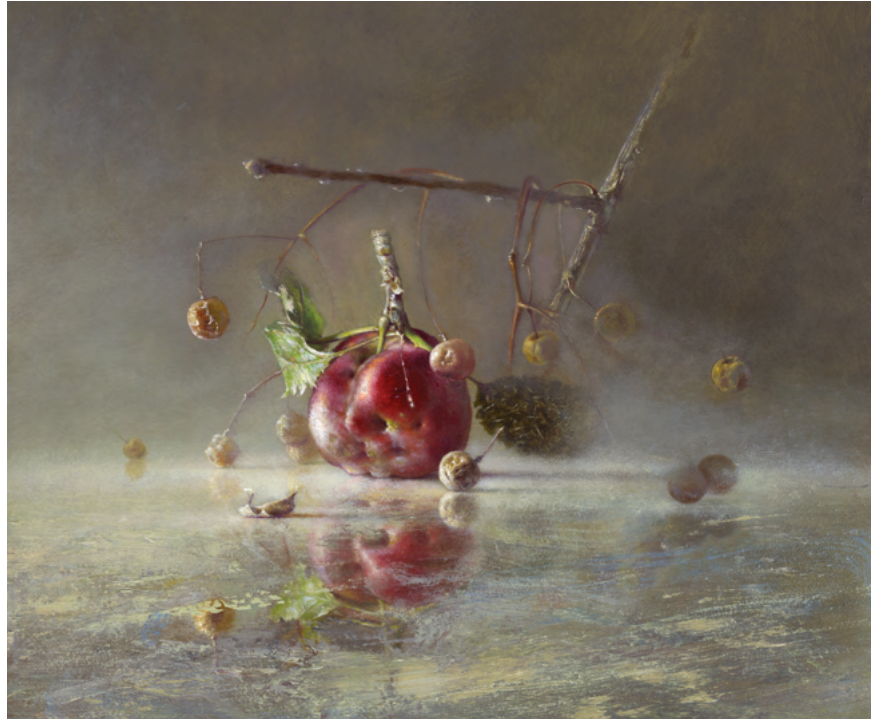
Philip Jackson (b. 1977), Transitory Reflections: Apple and Berries (detail), 2013. Oil on panel, 8 x 8 in. 2014 Red Clay Survey Purchase Award, Funds provided by the HMA Docents, 2014.12

This exhibition is organized by the Huntsville Museum of Art.