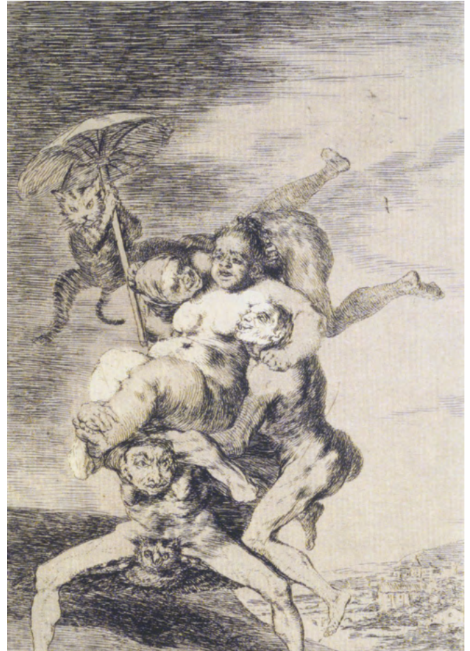
Francisco de Goya y Lucientes (Spanish, 1746-1828), Donde va Mama? ( Where is Mother Going? ), from the series Los Caprichos , plate 65, 1797-1798. Etching and aquatint on laid paper, 8 1/4 x 6 1/2 in. Huntsville Museum of Art, Leonard Walker Peeler Bequest, 1991.01.26

Modernism was a global movement that arose at the beginning of the twentieth century, encompassing Impressionism, Surrealism, Cubism, Fauvism, Constructivism, Minimalism, and Postmodernism, to name a few. During this period, printmaking as a medium shifted from being utilitarian, or required as a tool of reproduction, to being an artistic means for creativity, expression, and experimentation.