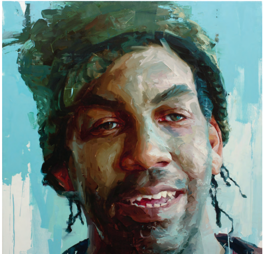
Aron Belka (American, b. 1974), Clifton Faust , 2018. Oil on canvas, 48 x 48 in. Museum Purchase. Funds provided by the Dr.

This exhibition is organized by the Huntsville Museum of Art.