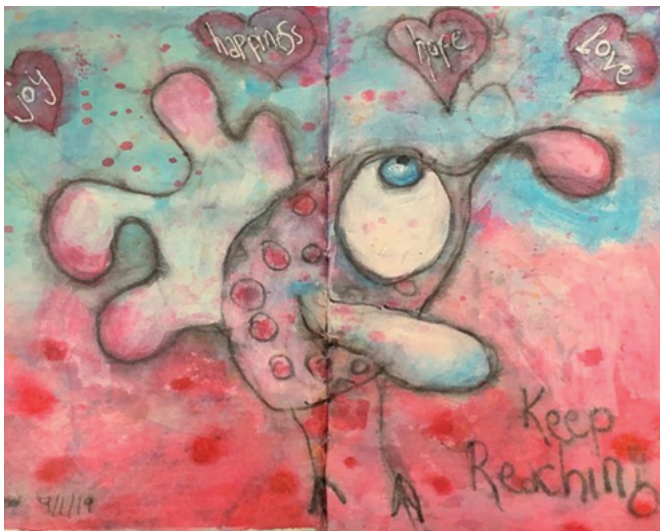
Leslie Wood, Joy , Forgiveness Journal , mixed media © 2023

Friday-Saturday, February 2-3, 2024 9:00 a.m. - 4:00 p.m.