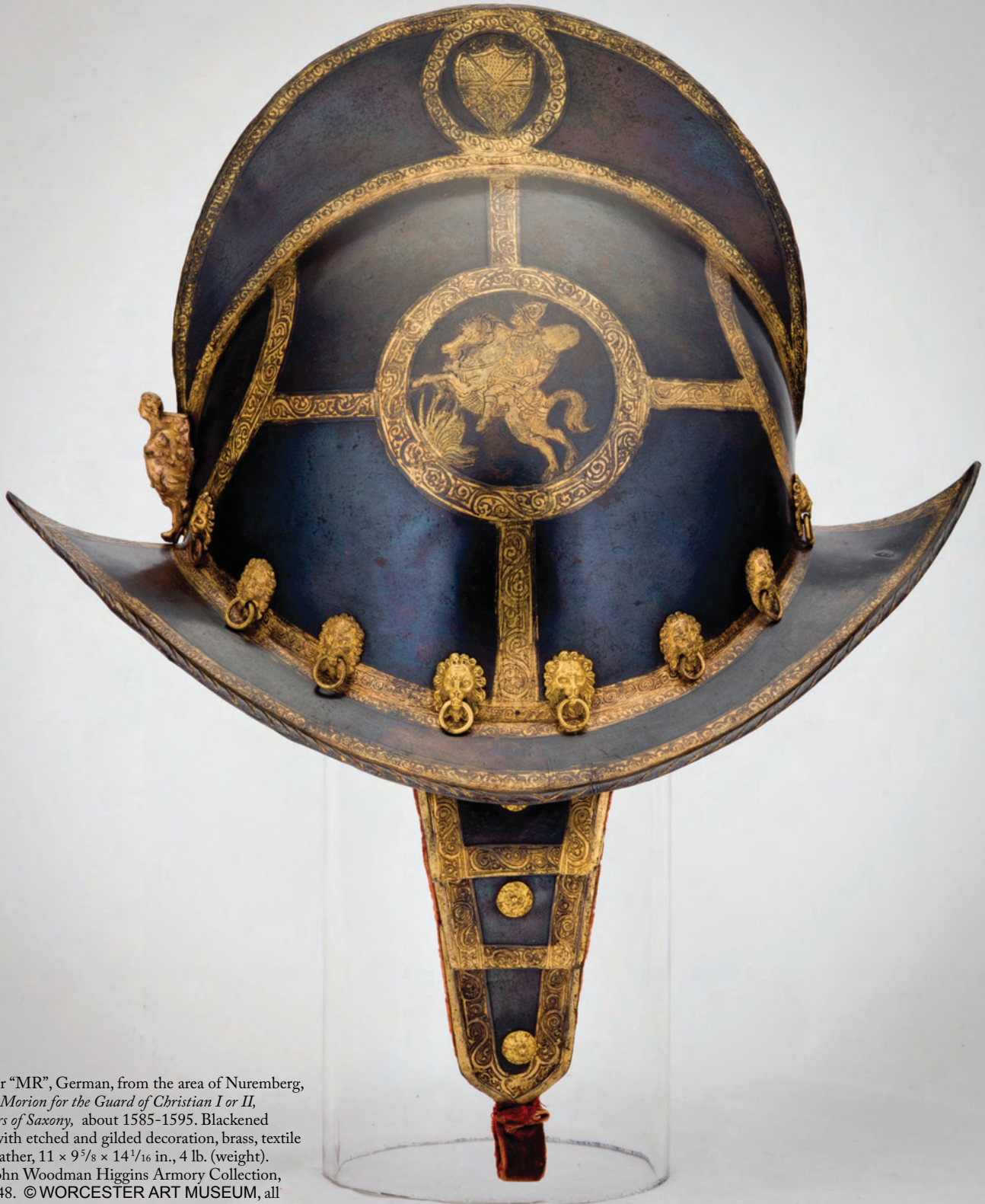
Master "MR", German, from the area of Nuremberg, Comb Morion for the Guard of Christian I or II, Electors of Saxony, about 1585-1595. Blackened steel with etched and gilded decoration, brass, textile and leather, 11 × 9 5 / 8 × 14 1 / 16 in., 4 lb. (weight). The John Woodman Higgins Armory Collection, 2014.48.

November 10, 2023-January 14, 2024 | Huth, Boeing, Salmon, Haws, and Chan Galleries