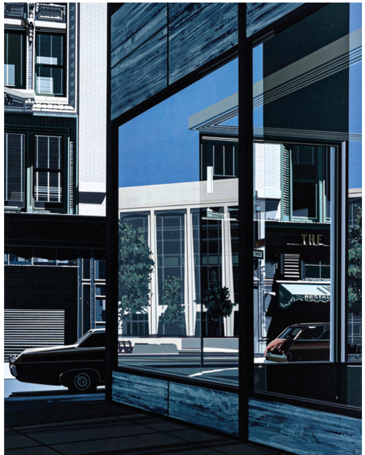
Richard Estes (b. 1932), The Restaurant , from Urban Landscapes 2 , 1979. Color silk-screen, ed. 98 of 100, 17 3/4 x 14 in. Purchased with the aid of funds from the National Endowment for the Arts, with matching funds from the Museum Association, 1980.27 © Richard Estes, Courtesy Schoelkopf Gallery