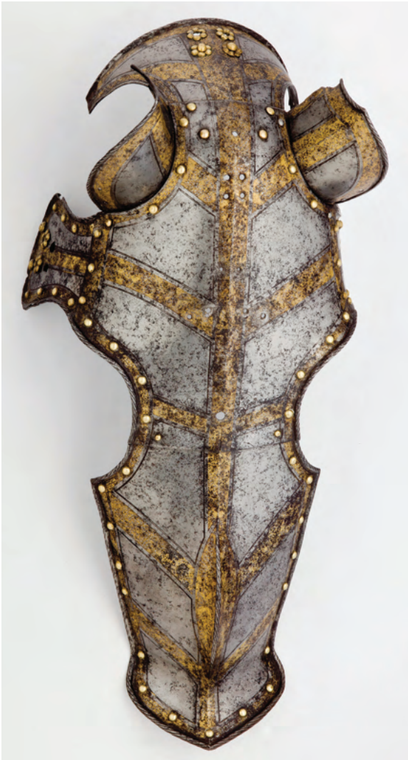
Southern German, from the area of Augsburg, Shaffron (Horse's head armor), about 1560. Etched and gilded steel, brass and leather, 24 x 11 x 8 1/2 in., 3 lb., 14 oz (weight). The John Woodman Higgins Armory Collection, 2014.10.1.1.