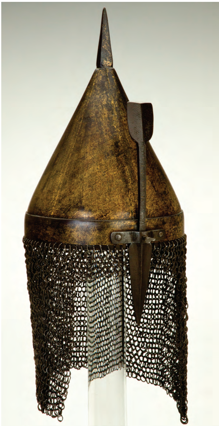
African, from the Sudanic Region, Helmet, 1800s. Russeted iron with gilding, 11\frac{13}{16} \times 21\frac{1}{4} \times 8\frac{1}{4} in.), 5 lb., 9 oz (weight). The John Woodman Higgins Armory Collection, 2014.91.