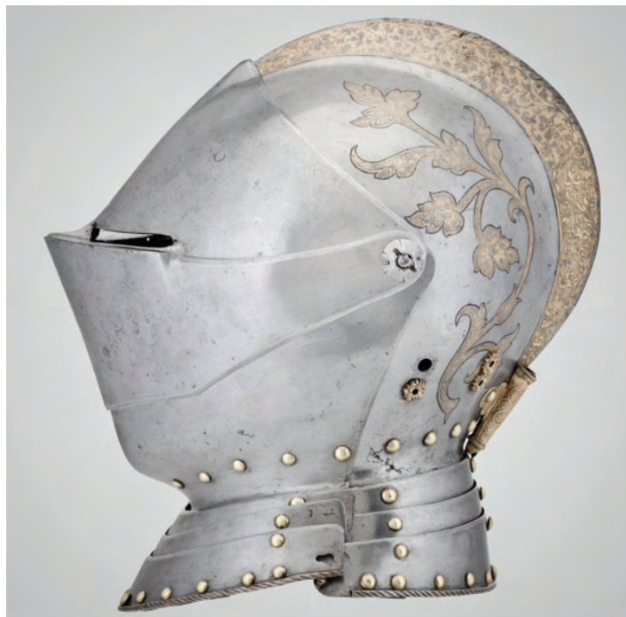
Southern German, from the area of Augsburg, Close Helmet for the Foot Tourney, about 1590. Steel, brass and leather fragments, steel formerly blued with etching and gilding, and brass, 12\frac{1}{2} \times 9 \times 13\frac{1}{2} in., 11 lb., 15 oz (weight). The John Woodman Higgins Armory Collection, 2014.1113.