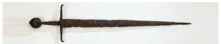
Western European, hilt is possibly English, Broadsword of the 'Castillon' Group , 1400–1450. Steel with traces of organic materials from grip and scabbard, 36\frac{1}{2} \times 29 \times 1\frac{15}{16} \times 8\frac{7}{16} in., 3 lb., 8 oz (weight). The John Woodman Higgins Armory Collection, 2014.56.