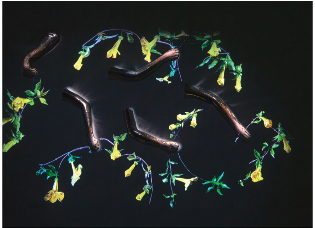
Courtney Egan (b. 1966), Self-Fulfilling Prophecy , 2019. Glazed ceramic and single channel HD video, 60 x 48 x 5 in.

Alabama State Council and the Arts Huntsville Museum of Art Guild