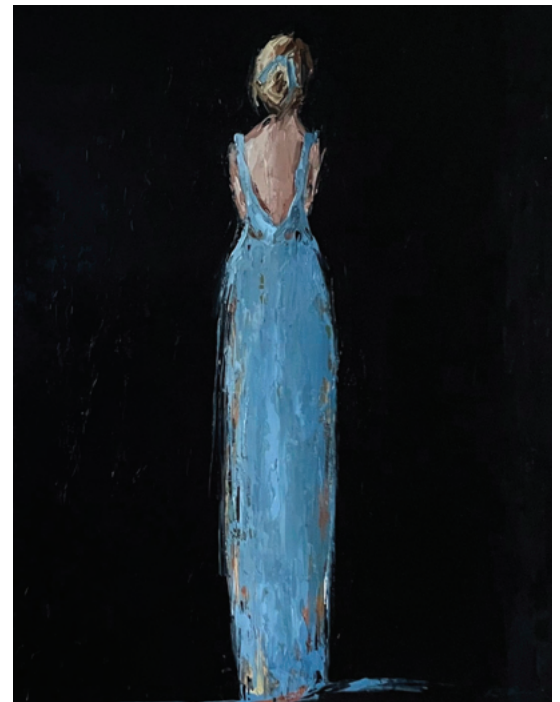
Geri Eubanks, Lady in Blue . Oil on canvas, 20 x 16 in. framed