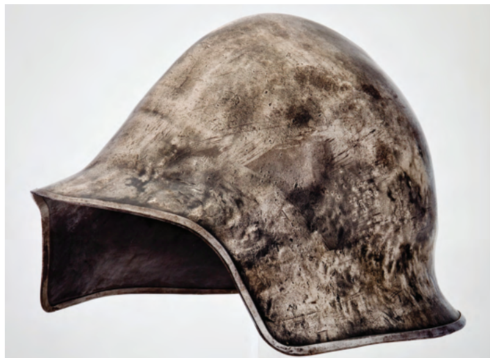
Manufactured by Worcester Pressed Steel, Prototype Experimental Helmet Model 2 , 1917. Steel, 10\frac{5}{8} \times 10\frac{5}{8} \times 14\frac{9}{16} in.), 2 lb (weight). The John Woodman Higgins Armory Collection, 2014.2.