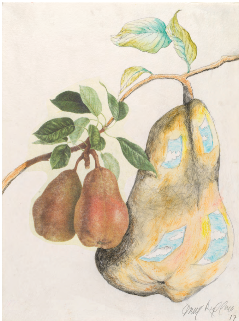
Ginny Ruffner, Pyrus fenestrata (Pear with windows), 2017. Watercolor, pencil, and image transfer on paper, 18½ x 14½ in. Collection of the artist.

sometimes humorous adaptations, as well as 19 original drawings by the artist that were the inspiration for the AR images. “This is nature reimagining itself,” said Ruffner. “The imagination cannot be exterminated. It just re-creates itself. To me, ‘Reforestation’ is about hope.”