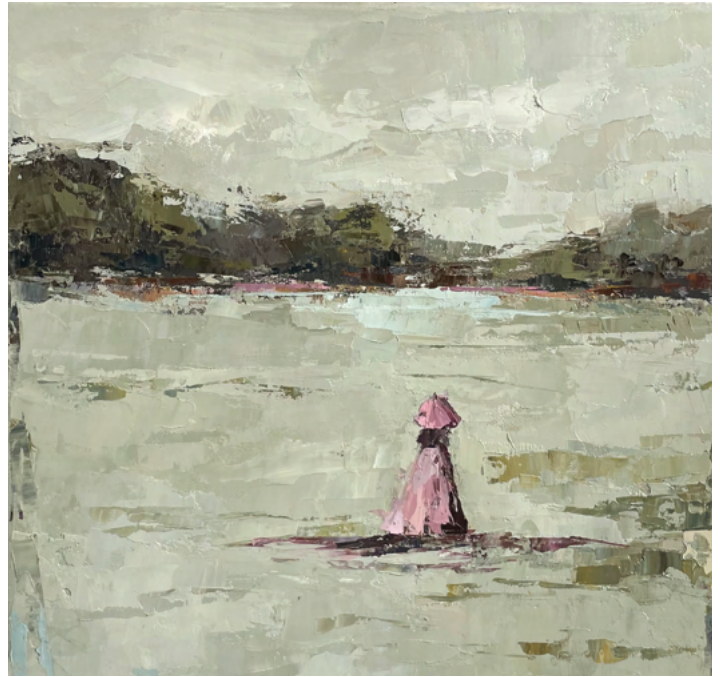
Geri Eubanks, The Journey II . Oil on canvas, 12 x 12 in. framed