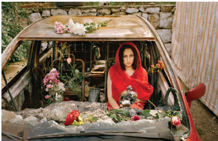
Rania Matar (Lebanese American, b. 1964), Farah, Aabey, Lebanon , 2020. Archival pigment print, 28 3/4 x 36 in.

The Huntsville Museum of Art is the first venue to host Rania Matar: SHE . This exhibition is organized by Rania Matar and the Museum Box.