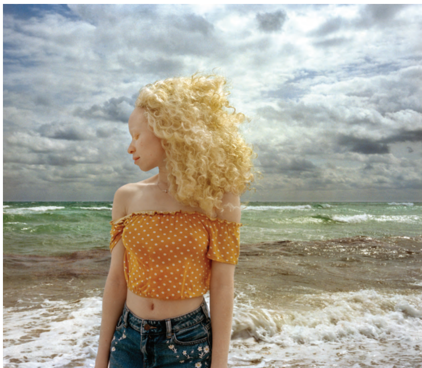
Rania Matar (Lebanese American, b. 1964), Rayven, Miami Beach, Florida , 2019. Archival pigment print, 28 3/4 x 36 in.