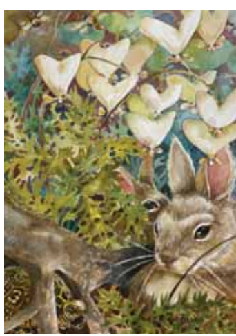
Dutchman's Breeches, Rabbit & Turtle, watercolor