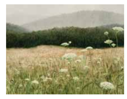
Mist & Lace, 2017, watercolor ©2023 Alan Shuptrine

Visit hsvmuseum.org under Learn – Master Artist Workshops for 2024-2025 workshops!