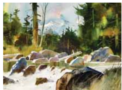
When the Snow Melts, watercolor ©2023 Tony Couch