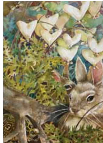
Dutchman's Breeches, Rabbit & Turtle , watercolor ©2023 Pat Banks