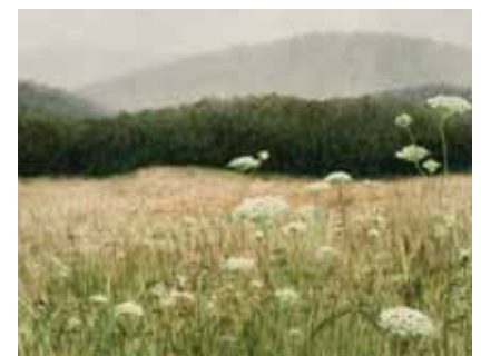
Mist & Lace , 2017, watercolor ©2023 Alan Shuptrine

Visit hsvmuseum.org under Learn – Master Artist Workshops for 2024-2025 workshops!