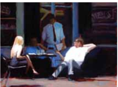
We'll Have Another Round, oil on panel ©2024 Dan Graziano