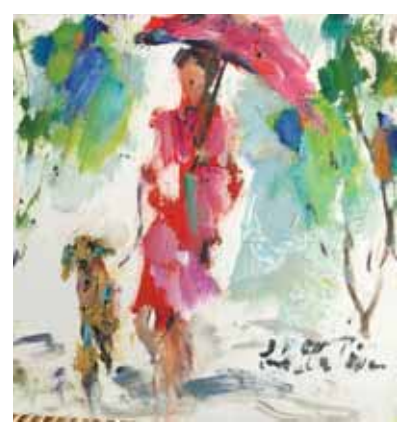
Happy Girl, Happy Dog , oil on canvas ©2024 Linda Ellen Price