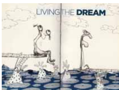
Dream Living, 2024, mixed media ©2024 Leslie Wood