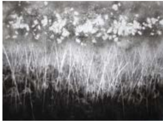
Photo Courtesy of Artist: Gary Chapman, Landscape , charcoal © 2024