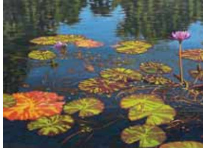
Waterlilies at Brookgreen, oil on panel