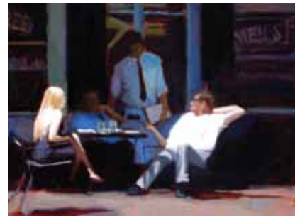
We'll Have Another Round , oil on panel ©2025 Dan Graziano