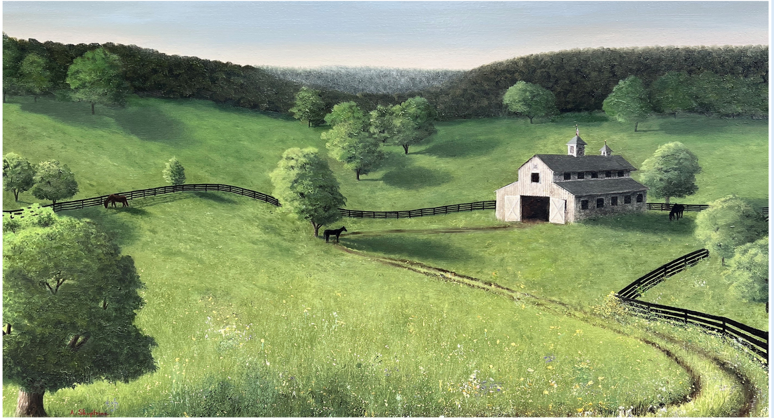
FEATURED ARTIST: ALAN SHUPTRINE