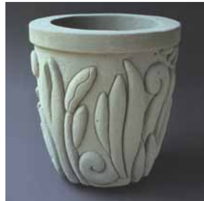
Phyto Planter , concrete ©2026 Elder Jones

Visit hsvmuseum.org under Academy for upcoming 2027 Artist Workshops!