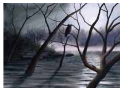
Nightwatch , watercolor ©2026 Alan Shuptrine